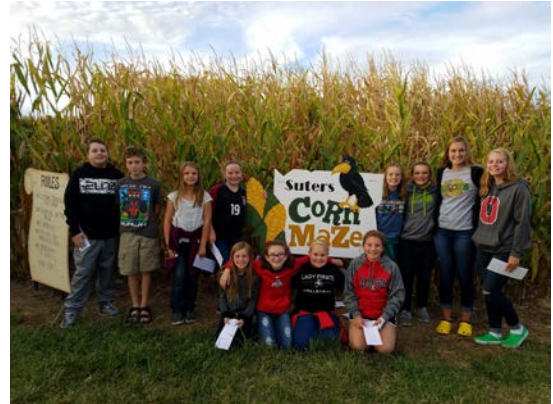
Youth Group Trip to Suter's Corn Maze